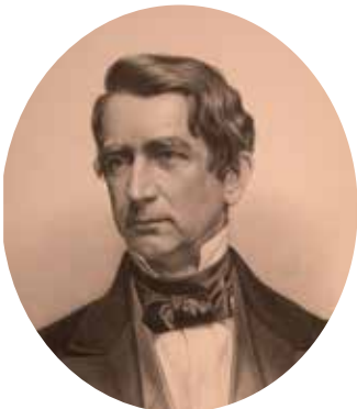
William Henry Seward

ITEM #9 - 2/5 Bushel Box $39 22-24 lbs. per box