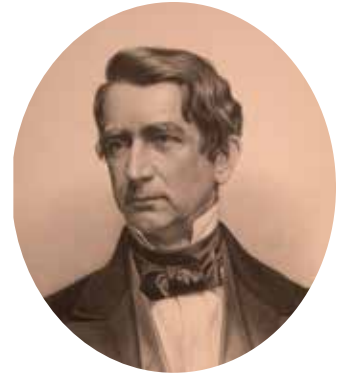
William Henry Seward