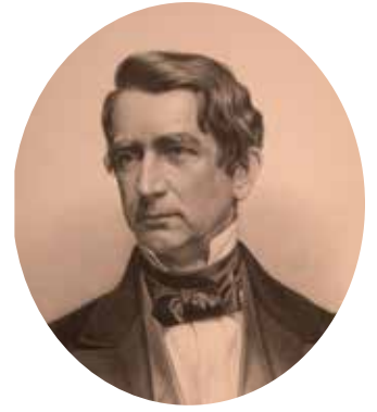
William Henry Seward

P.O Box 97 • Florida, New York • 10921-0097